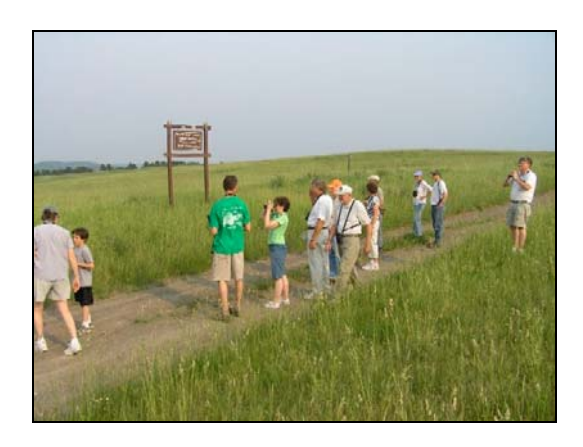
photo taken at Piney Tract during our Grasslands Conference