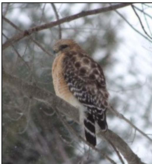
You might see a Red-shouldered Hawk on your Birdathon or PAMC.