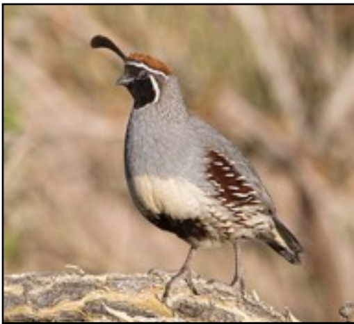
Gambel's Quail