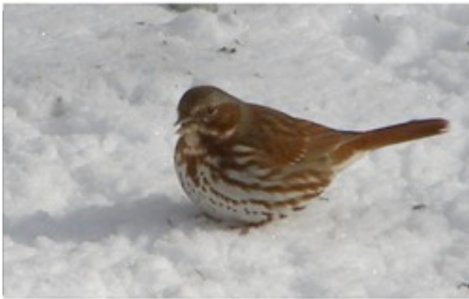
Fox Sparrow by Flo McGuire