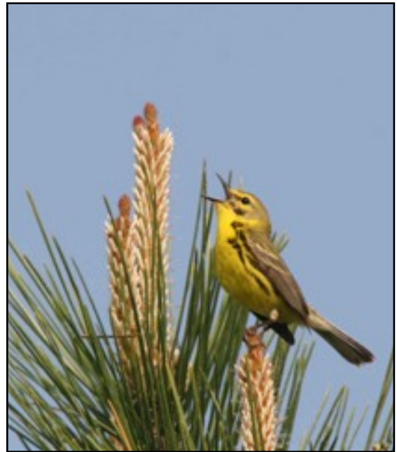
Prairie Warbler