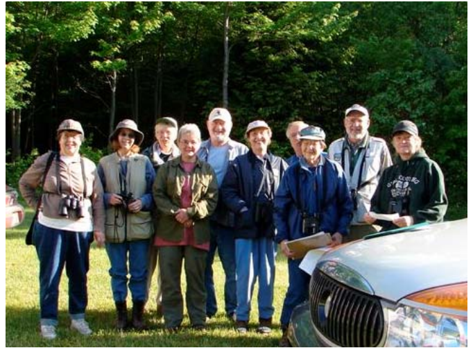
An eager group of Blockbusters