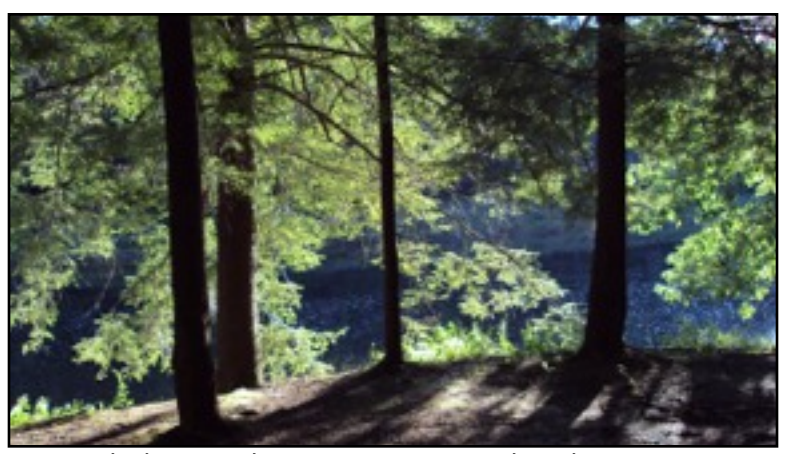
Hemlocks at Cook Forest, River Drive