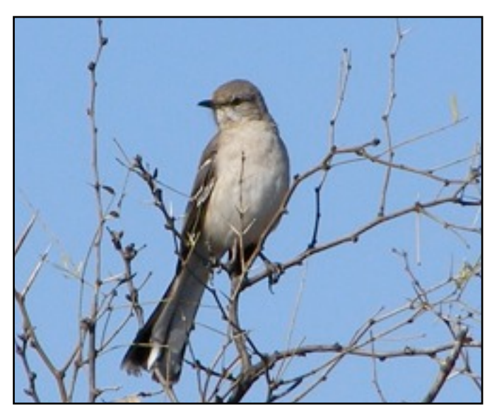
The Northern Mockingbird is the state bird of Arkansas, Florida, Mississippi, Tennessee, and Texas