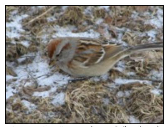
American Tree Sparrows lingered till mid-April

Wild Turkey are a common sight in the county, but it was very unusual to find a hen on a nest site in scrub and brush not even 10 feet off a rural dirt road near CV 5/11(MM,CW). The nest had 16 eggs in it, and was located under some wild honeysuckle bushes. On the following day all but one egg remained but the bird was not seen again and subsequent checks showed the nest site to be unsuccessful, likely due to high disturbance probable at this location. Common Loon is a species not uncommon to the county in migration, however this year 4 birds were found on the Clarion River outside of Clarion 4/17 (PM). This river is smaller and has poorer quality than the Allegheny and Kahle Lake where they are normally found. The last bird noted for the season was seen at Sarah Furnace 5/11 on the Allegheny River (CW). For raptor sightings, the best of the season was seen at CR