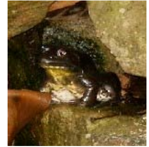
(Green Frog in January)